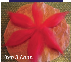
Step 3 Cont.