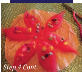
Step 4 Cont.