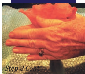
Step 8 Cont.